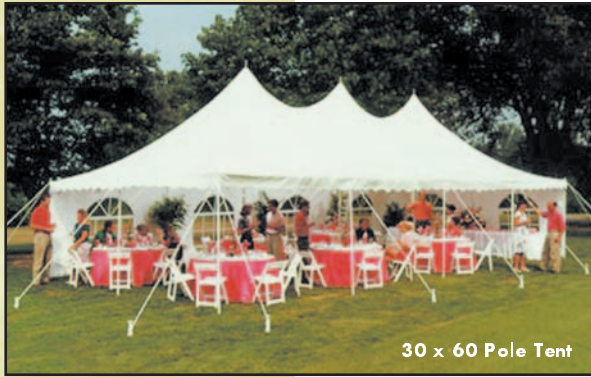
30 x 60 Pole Tent

Events Party Rentals is a special events company renting pole tents, frame tents, tables, chairs, heating, and lighting.