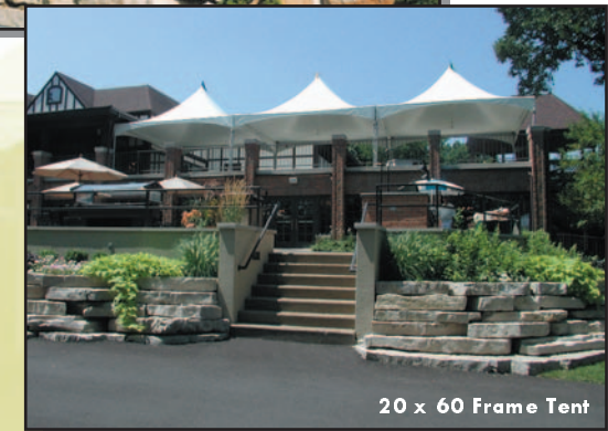
20 x 60 Frame Tent