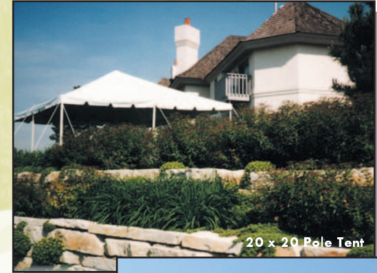
20 x 20 Pole Tent